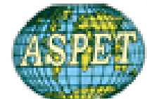
South Asian Petrochem Private Equity